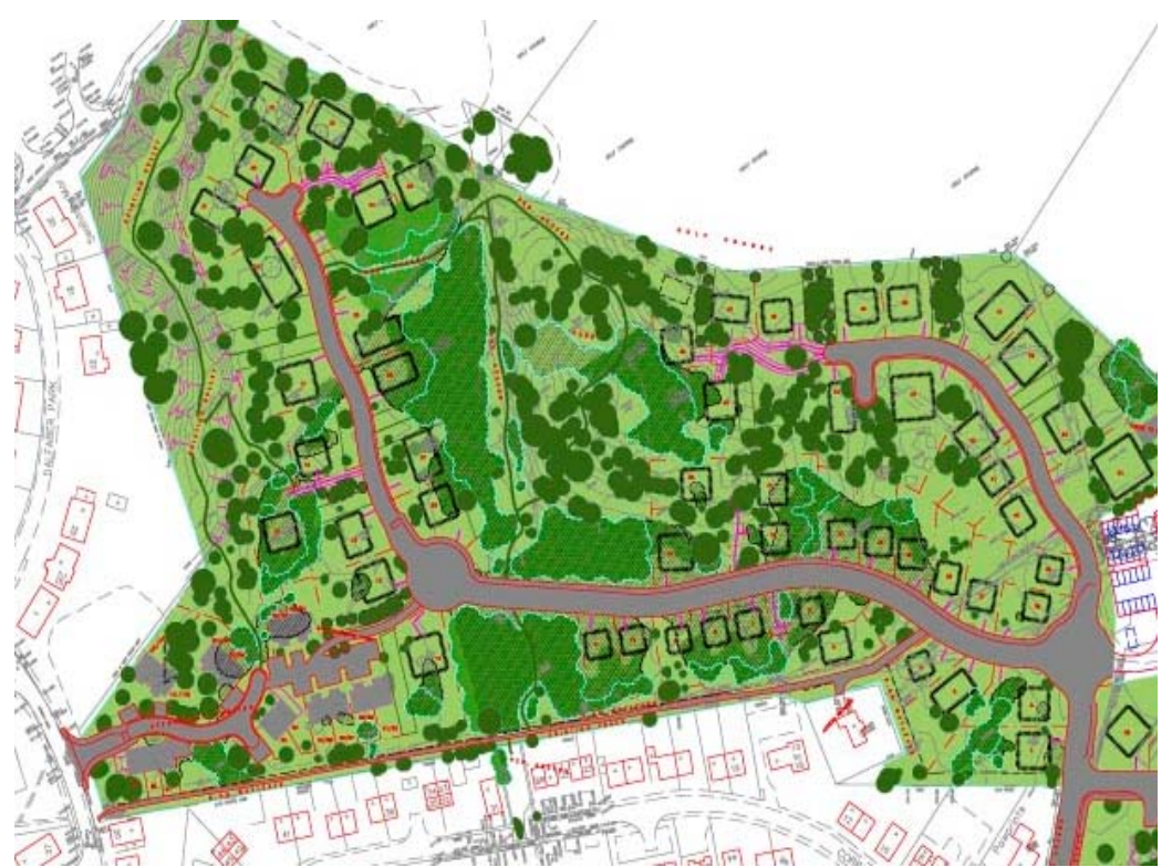
Fig. 10 : individual house plots 1 – 54 proposed in main body of subject site, with proposed affordable housing component of 25 units located to the west, adjacent to Spey Avenue.