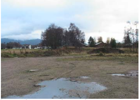
Fig. 5 : view towards south eastern corner