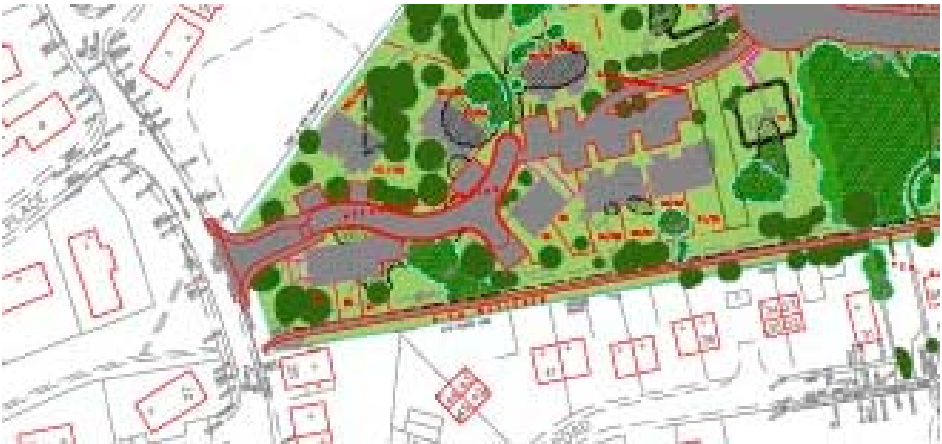
Fig. 15 : proposed affordable housing element in western area of site