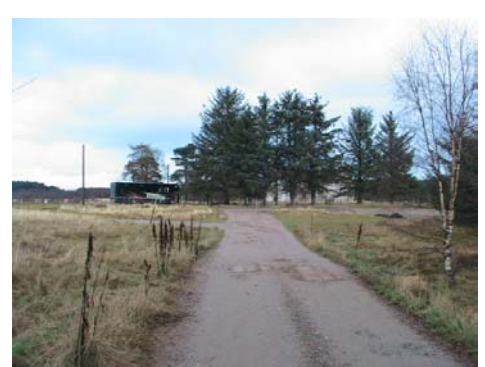
Fig. 6 : existing access into site