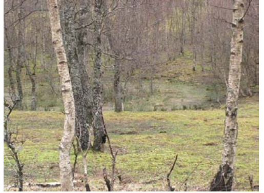
Fig. 14 : view from east towards central woodland area of site.