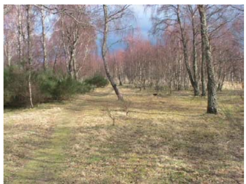
Fig. 11 : existing track along south boundary Fig. 12 : view north in vicinity of plots 13/14