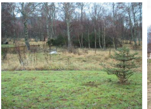
Fig. 16 : western area from Spey Ave.