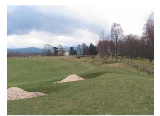
Fig. 13 : Eastern site boundary