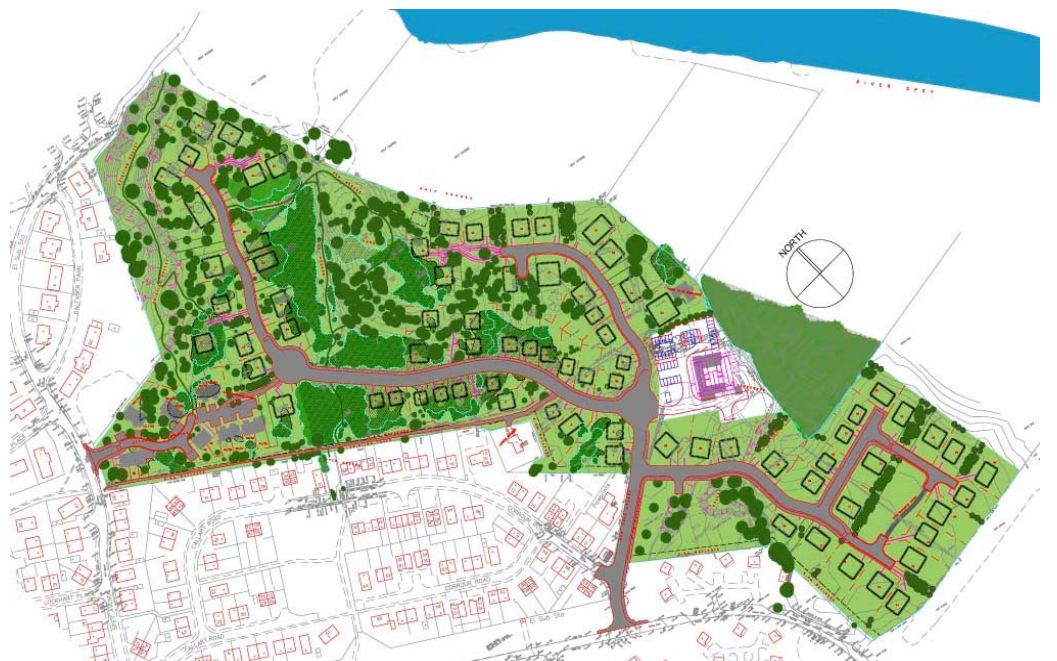
Fig.2 : Proposed site layout (note – white shading identifies the site of the golf clubhouse and is outwith the site boundaries of this application).

subject site, close to the rear boundaries of the properties on Callart Road, before emerging onto Spey Avenue to the north west. Vehicular access along the lane between Heather Cottage and Spey Avenue is restricted due to the presence of agricultural gates at either end. The access from the Dalfaber Road / Corrour Road area is proposed to serve the majority of the plots, whilst a second vehicular access is proposed off Spey Avenue to serve 25 properties, with pedestrian access linking this area into the larger part of the site.