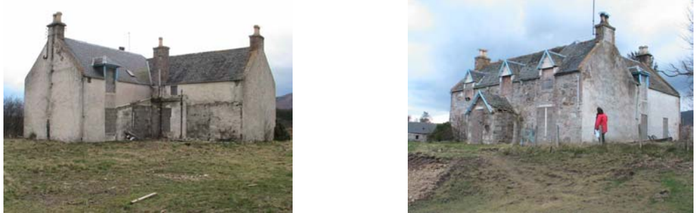
Figs 8 & 9 : existing derelict dwelling on eastern boundary

5. The largest section of new access spine road extends in a north westerly direction for approximately 235 metres, providing direct access to 22 plots en route, before traversing in a northerly direction for approximately 150 metres into a cul de sac which serves a further 16 The remainder of the proposed plots (no's 39 - 54) are plots. accessed from a smaller cul de sac extending in a north easterly / northerly direction. 16 of the 104 plots proposed are located contiguous to the boundary with the developing golf course. The development of one of those proposed plots (no. 54) located adjacent to the site of the golf club house would necessitate the demolition of an existing disused dwelling house. The ground level of the land adjacent to the golf course is generally higher than land to the east, offering views over the golf course and down to the River Spey beyond.