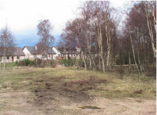
Fig. 17 : approx. position of houses 95 - 99