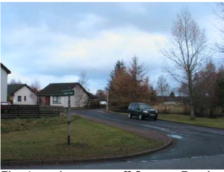
Fig. 4 : main access off Corrour Road