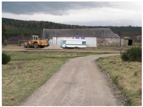
Fig. 7 : Steading outside site boundaries